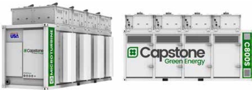
C800S ICHP Power Package

The Signature Series Microturbine provides ultra-low emissions and reliable electrical/thermal generation from natural gas.