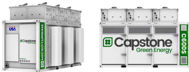
C600S ICHP Power Package