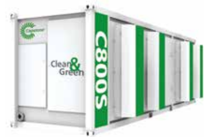
C800S Power Package