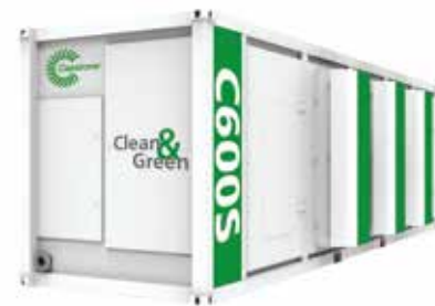
C600S Power Package