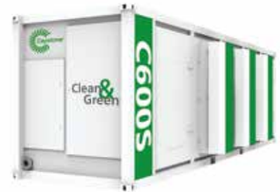
C600S Power Package