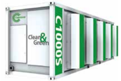
C1000 Power Package