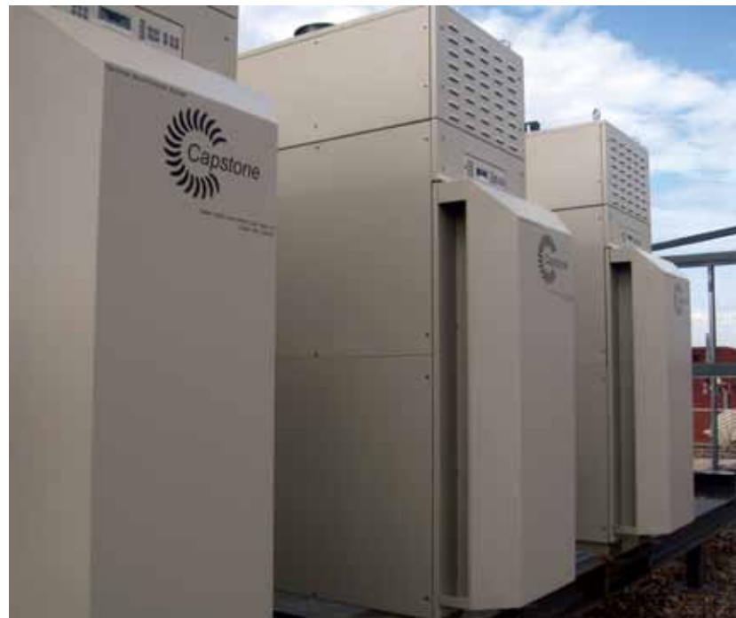
Three natural gas C65 ICHP Capstone microturbines provide electrical and thermal power at the Four Seasons Hotel Philadelphia.

“Reciprocating engines have to be rebuilt at 22,000–23,000 hours, have oil replaced regularly, consist of lots of moving parts, and have high vibration and noise. We can’t have noise at a hotel – that would be a disaster,” Dixon added.