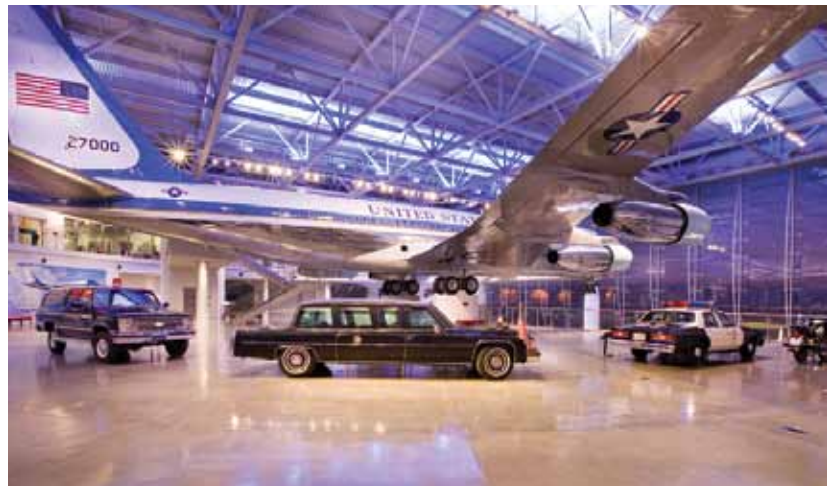
Sixteen Capstone C60 microturbines running on natural gas provide electricity for the Air Force One Pavilion.